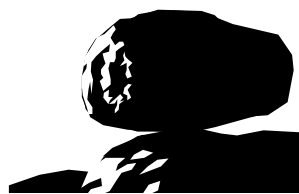
THE SEED FALLS ON ROCKY GROUND

In the first, the seed falls on packed ground or a road and the birds come and take it away. Jesus said that this is like those who hear God's word and the devil steals it away before they can believe and be saved.