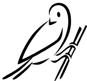
THE SEED FALLS ON PACKED GROUND

Jesus also told a story about a farmer who sowed seed in his field. You can read about it in Luke 8:5-15. In that story, Jesus says that the seed represents the Word of God and that the different types of ground that the seed is sown on are the lives and the hearts of those who hear the Word.