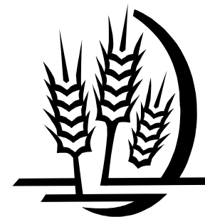
THE SEED FALLS ON GOOD SOIL

Finally, there are the seeds that fall on good ground; people who hear the Word with an open heart and keep what it says. These seeds are going to bear the kind of fruit that God desires for them.